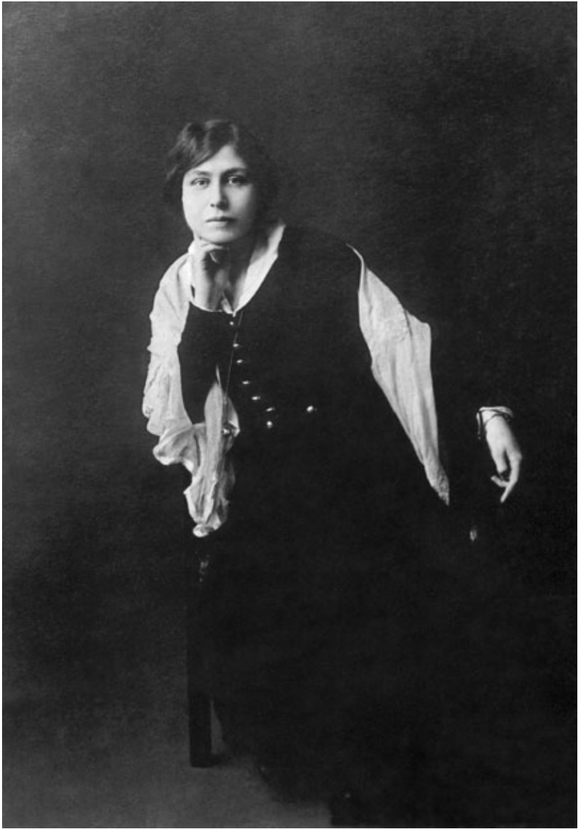
The Mother in Tokyo, 1917